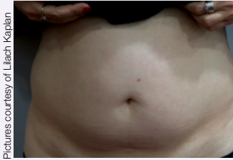
Before Contour Treatments

The innovative Contour combines the power of focused 3DEEP™ energy with the benefits of tissue lifting vacuum to substantially increase the energy delivery and volumetric heating of the treatment area. This allows the RF energy to achieve higher treatment temperatures, which results in superior body tightening and contouring, and truly effective cellulite reduction.