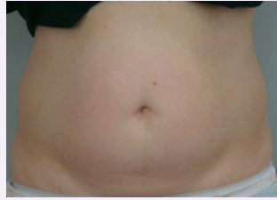
After 5 Contour treatments