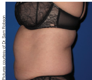
Before Shaper treatments

The Shaper is the ideal solution for sculpting larger body areas, such as the abdomen, buttocks and thighs. The Shaper's unique six concentric electrodes are controlled simultaneously to maintain better volumetric heating in the treatment area, maximizing the focused 3DEEP RF energy effect, tightening lax skin, sculpting and contouring the body, and reducing body circumference.