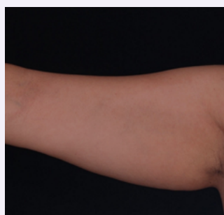
After 3 Mini-Shaper treatments