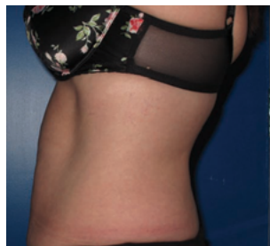
After 9 Shaper treatments